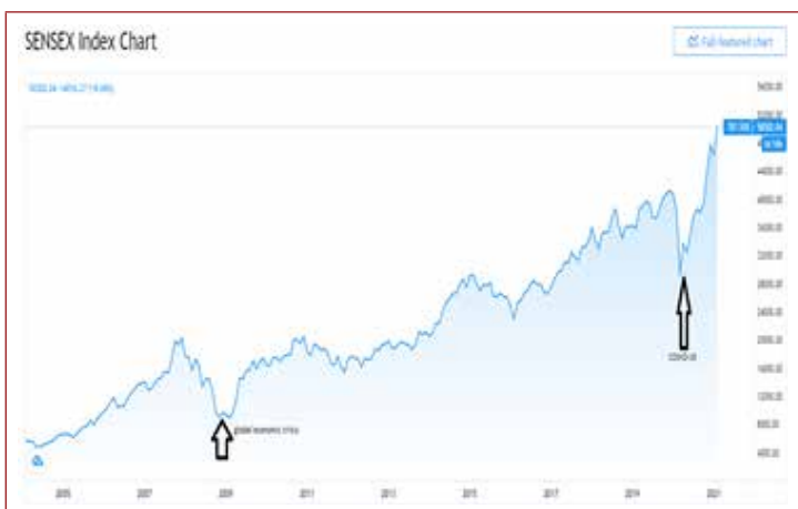
BSE Sensex Index yearly Chart

Market never moves in one direction continuously for longer period of time. It goes up then comes down, stays range bound and in this way in the long run keeps moving higher and higher. In between there are major corrections /crash like 2008 world financial crisis and recent 2020 crash caused by outbreak of COVID-19 pandemic. Such crash can last for several months to years. In such a situation a SIP investor gets units at a cheaper rate resulting in reduced average cost.