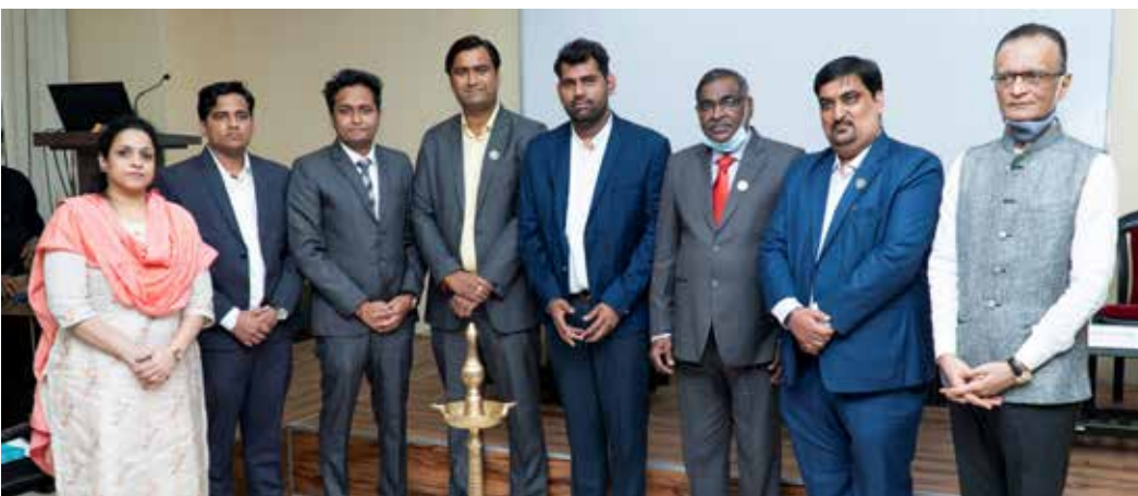
Group photo taken at the Inauguration Session